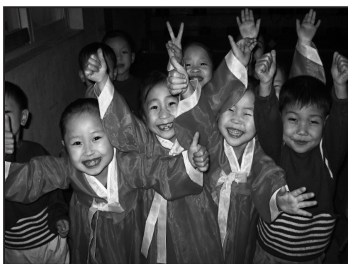
Happy children at Wonsan kindergarten orphanage.

I am sad at the separation that's occurred for 60 years and I am exasperated by the eternity it seems to be taking the governments of the South and North and their respective allies to see eye-to-eye.