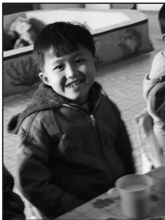
Snack time at Dongchon kindergarten.

been hit by a twin typhoon and tsunami, destroying crops and livestock alike. So Wonsan is where we tried to dedicate a bulk of this trip's resources, adding VitaCows and bringing medicines to make the winter less bitter. We discovered that many orphanages and boarding schools are without means of heating during the winter, and many have leaky roofs. We hope that donors can partner with First Steps to address these urgent but fixable needs.