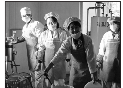
Bongchon food factory in Wonsan .