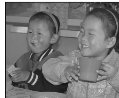
Soymilk time is happy time in Tongchon.

we saw signs of dedication and commitment on the part of the workers and healthy growth and happy smiles from the children. While there are still children who suffer from malnutrition, their daily allotment of soymilk is steadily bringing them