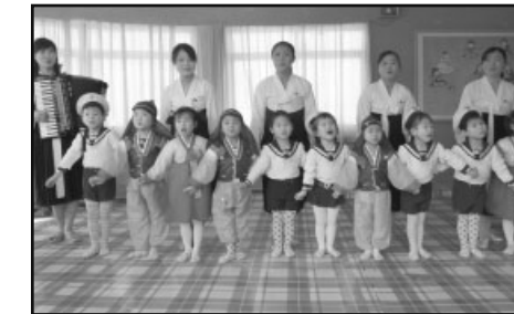
Children sing for visitors at Nampo orphanage.

Another lasting impression came at an orphanage and kindergarten in Nampo where the children put on spectacular musical performances for us. The children at