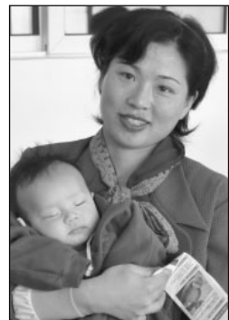
Healthy mother and child, both Sprinkles users.