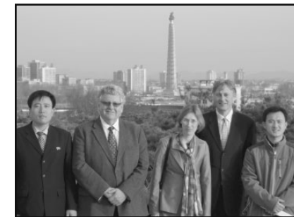
Visitors see the sites in Pyongyang

After returning from North Korea, I found myself with a strange collection of memories and emotions. DPRK is one of the most isolated countries in the world, cloaked in high security. Yet the hard working people and the children were magnificent and inspirational, despite their daily hardship.