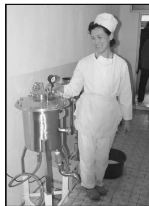
Worker tends to her VitaCow.

The Sprinkles micronutrient program is a fantastic way to provide essential micronutrients to pregnant and nursing women, as well as their children after they are weaned.