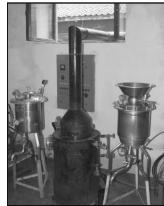
New VitaGoat machine in Nampo.

Like most first-time visitors to DPRK, I had many misconceptions about what the land and people might be like. Although I was not surprised to find challenges such as poor infrastructure and scarce