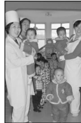
Children and staff greet visitors in Wonsan.

health and growth. Our heartfelt thanks go out to all who pray, give and serve. And our fervent prayers join yours as together we ask our Heavenly Father to bless these precious children and to give them, this day, their daily food.