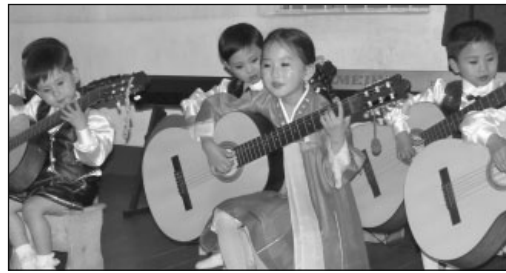
Guitar players entertain at Ryongsu Kindergarten.

Ryongsu Kindergarten were almost like professionals. A group of about a dozen six-year-olds played guitar together with bounding enthusiasm and well-coordinated theatrics, all the while in cute little costumes.