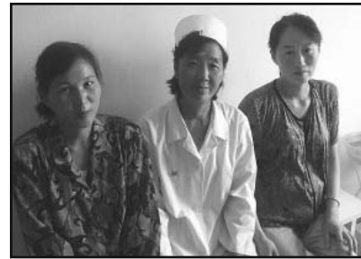
Doctor (centre) consults with two pregnant women about Sprinkles.

Child Nutrition has entered its second year, with about 34,000 children and 38,000 pregnant and nursing women receiving the acclaimed Canadian-developed micro-nutrient. So far, First Steps has shipped 3.5-million sachets which are "sprinkled" on food to combat anemia and other nutritional ailments. Preliminary study results after one year showed that the malnutrition rate fell from 56