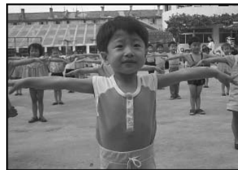
Soymilk gives energy for exercises.